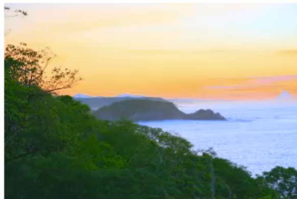
Sunrise over the coast in Huatulco, Oaxaca, Mexico

🕒 APRIL 5, 2015 👤 KCRISTIANO 💬 LEAVE A COMMENT ✎ EDIT